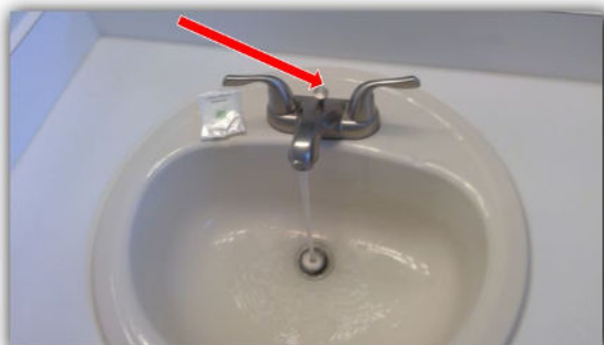
Stopper not operational at rear bath. Requires repair.