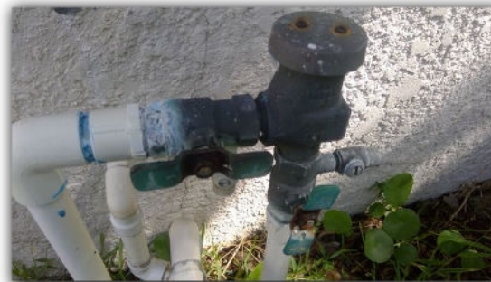
Back Flow Valve