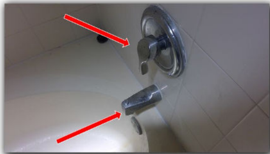
Valve handle is loose and valve does not shut completely off. Requires repair.