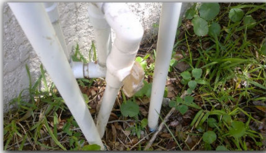
Main Shut Off Valve