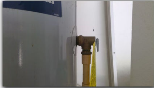
Pvr Valve Present