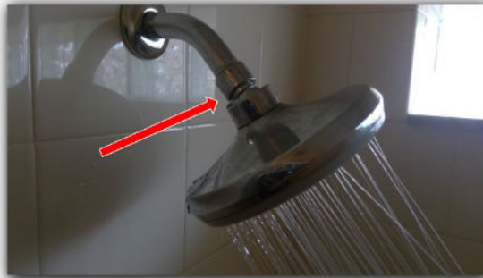
Spray nozzle has a minor leak. Requires repair.