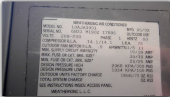
mfg date of compressor 1998