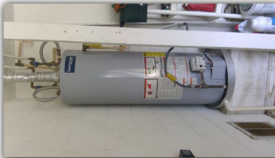
Overall view of Water Heater