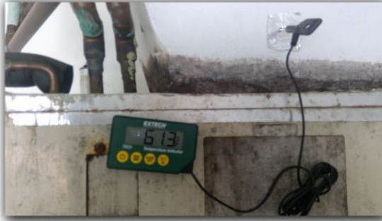
Temperature of supply air