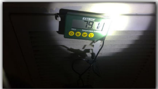
temperature of return air