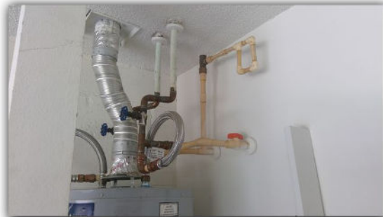
Main Supply Lines