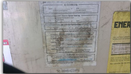
mfg date of air handler 1998

Note: The typical life expectancy of the average system is 15-20 years. However, many home owners will replace their systems after 10-15 years to achieve a higher efficiency rating. If your system is between 15-20 years it should be considered at the end of its life expectancy and replaced.