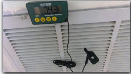
temperature of return air