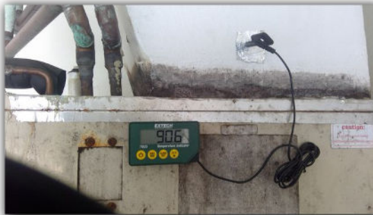
Temperature of supply air

Temperature differentials of heating system of system one: