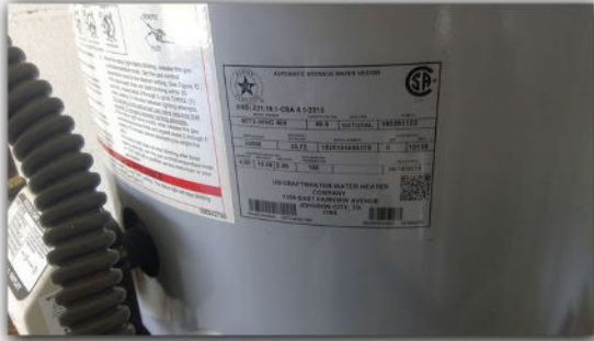
Water Heater Manufacturing Date